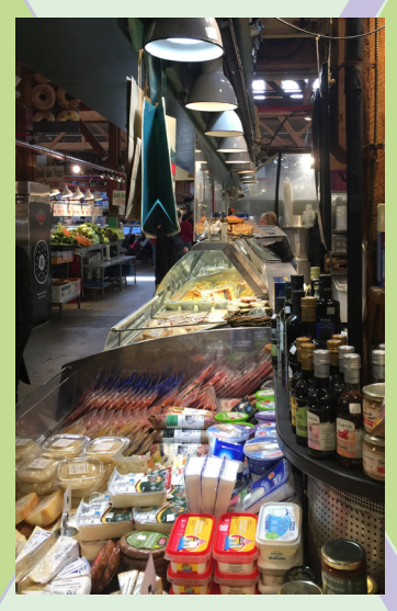
Inside the Public Market there is also a handful of places to buy lunch, or get the ingredients needed to make it.