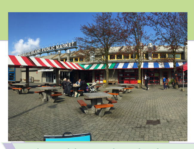
The Public Market also has occational musical performances by locals, this is ejoyed at the outside seating area.