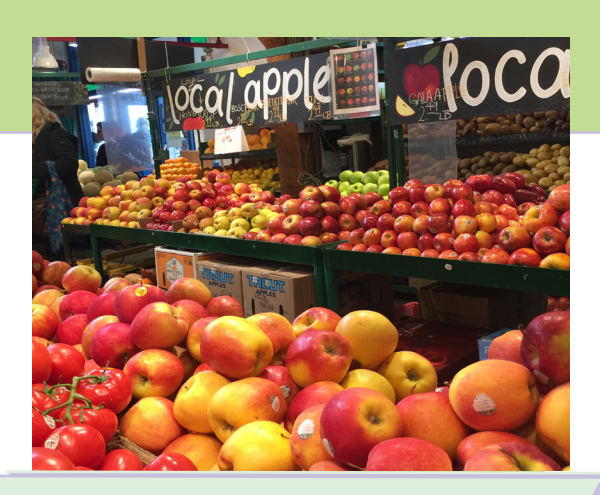
Inside the Public Market there is a wide variety of fruits, vegetables, and meats.