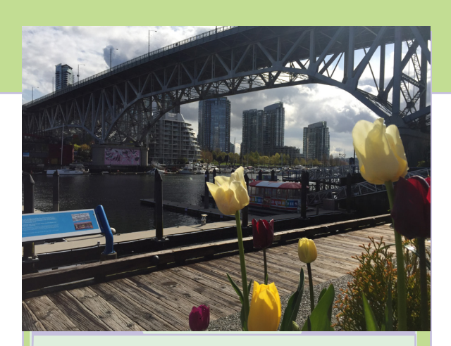
At Granville island there are many shops close by, there is also the popular Kids Market and Public Market to visit.