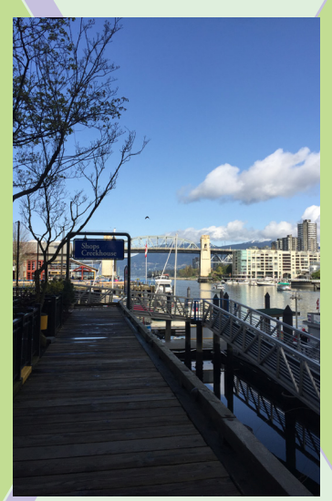
Here at the waterside people are able to enjoy the view of the bridge and far mountains.